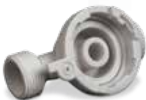
Hose fitting printed in DuraForm ProX GF