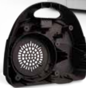
Back cover of vacuum cleaner printed in DuraForm EX Black