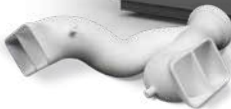
Manifold printed in DuraForm ProX FR1200