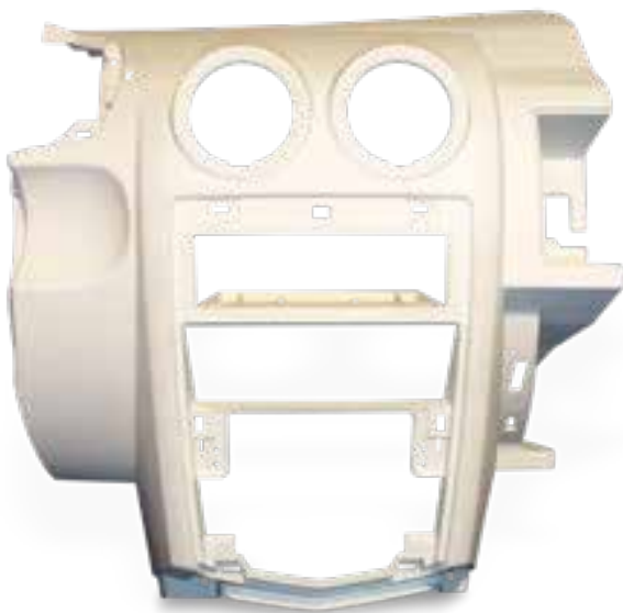
DuraForm PA Dashboard