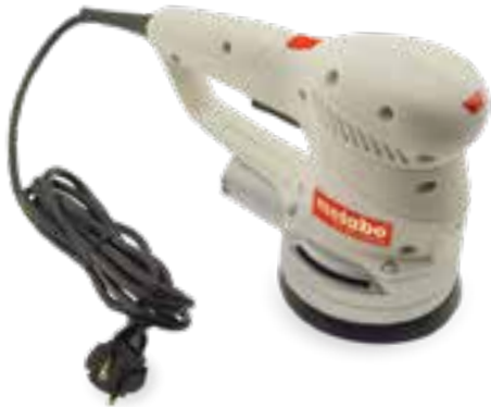
Sander tool housing printed in DuraForm PA material

3D Systems sPro SLS systems share a common architecture to produce high-resolution, durable thermoplastic parts available in medium to large build volumes.