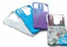
Data courtesy of FreshFiber